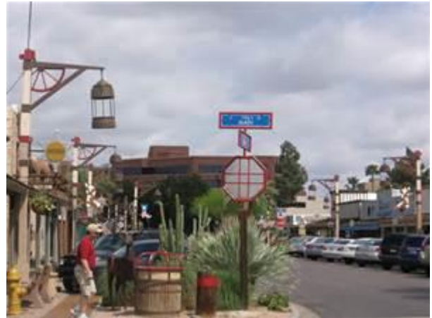
Beautiful Old Town Scottsdale, AZ