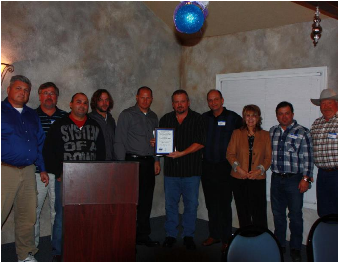
Excellence Award 2014 – Team Construction D&D