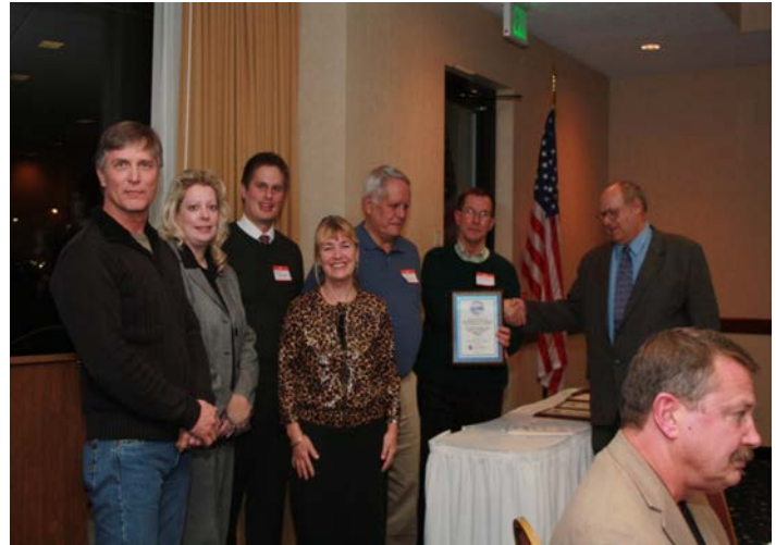
Excellence in Hazardous Materials Management SY Transfer Lines Replacement Project